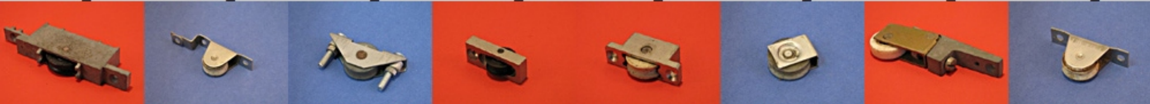
Ref:/ZIMG_0703 Ref:ZIMG_0703a Ref:ZIMG_0705 Ref:ZIMG_0706 Ref:ZIMG_0707 Ref:ZIMG_0707 Ref:ZIMG_0709 Ref:ZIMG_0709a