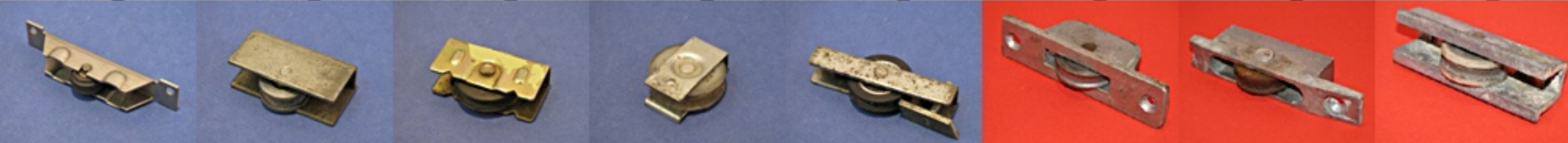
Ref:ZIMG_0677 Ref:ZIMG_0679 Ref:ZIMG_0680 Ref:ZIMG_0681 Ref:ZIMG_0682 Ref:ZIMG_0688 Ref:ZIMG_0689 Ref:ZIMG_0690