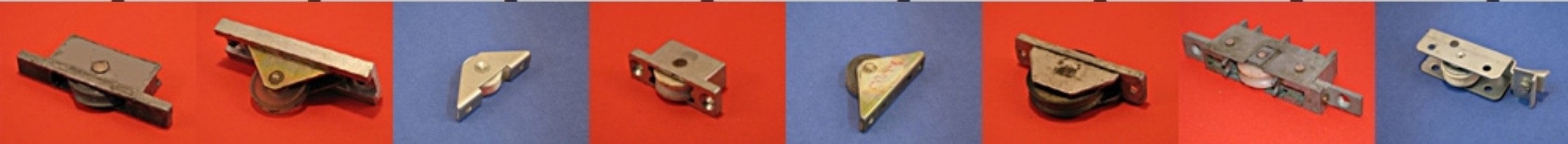
Ref:ZIMG_0692 Ref:ZIMG_0693 Ref:ZIMG_0695 Ref:ZIMG_0696 Ref:ZIMG_0696a Ref:ZIMG_0698 Ref:ZIMG_0699 Ref:ZIMG_0700