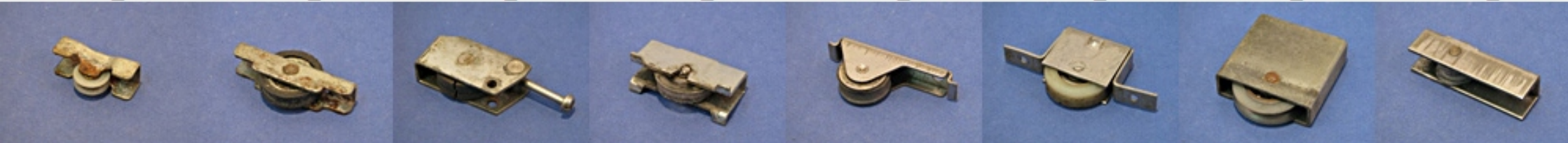
Ref:ZIMG_0668 Ref:ZIMG_0670 Ref:ZIMG_0671 Ref:ZIMG_0672 Ref:ZIMG_0673 Ref:ZIMG_0674 Ref:ZIMG_0675 Ref:ZIMG_0676