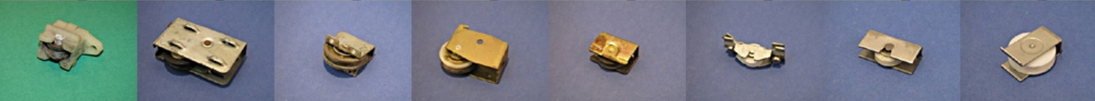
Ref:ZIMG_0285 Ref:ZIMG_0658 Ref:ZIMG_0660 Ref:ZIMG_0661 Ref:ZIMG_0662 Ref:ZIMG_0663 Ref:ZIMG_0664 Ref:ZIMG_0666