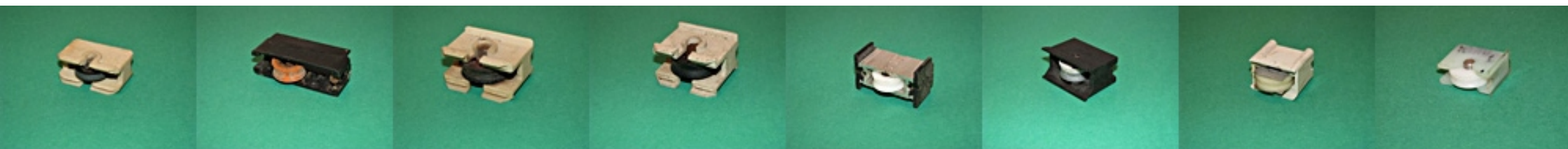
Ref:ZIMG_0221 Ref:ZIMG_0222 Ref:ZIMG_0224 Ref:ZIMG_0225 Ref:ZIMG_0227 Ref:ZIMG_0229 Ref:ZIMG_0233 Ref:ZIMG_0236